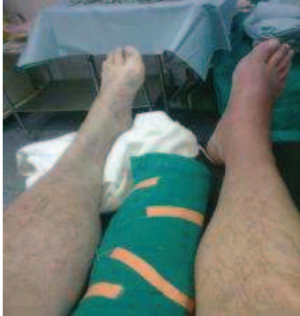
Figure 1: Left lower limb ischemia in a 55-year old man with multiple vascular risk factors who presented to hospital after an air flight. Cellulitis is evident on the right foot.

Examination revealed a non-tender erythematous right leg. The left leg was pale, cold and tender (figure 1), with absent peripheral pulsations. Sensation was reduced in the right leg and absent in the left.