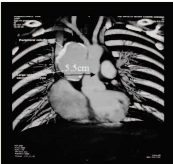
Figure 1: Computed Tomography (CT) angiography, coronal view, showing saccular aneurysm of ascending aorta (5.5cm in diameter).

A 15 year old male, who underwent operation for atrial septal defect (ASD) at 3 years of age, presented with recent syncopal attacks, swelling, and pain at the sternal wound site for the past two months. Evaluation at our hospital with Computed Tomography (CT) angiography ( Figure 1 ), revealed a saccular aneurysm of the ascending aorta (5.5cm in diameter) eroding into the sternum ( Figure 2 ).