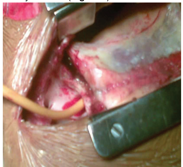
Figure 3: Intra operative picture showing antegrade root cardioplegia through the aneurysm, delivered through a 16F foley catheter.

The operation was performed employing femoro-femoral bypass, with an additional venous cannula placed in the pulmonary artery following redo sternotomy. The apex of the left ventricle was identified by transthoracic echocardiography (TEE) and vented via a small left anterior thoracotomy. Redo-median sternotomy was done, and the patient taken to deep hypothermic circulatory arrest (18 C°). The pseudo-saccular ascending aortic aneurysm was dissected and found to originate at the previous aortic cannulation site, and eroding into the sternum. It was opened, and excised proximally, starting from the sinotubular junction and extending distally to 1 cm below the origin of the innominate artery. The entire aneurysm and the adjacent part of the ascending aorta was heavily calcified. The right coronary artery and aortic valve were not involved. Myocardial protection was maintained with antegrade root cardioplegia delivered via a 16F Foley catheter ( Figure 3 ).